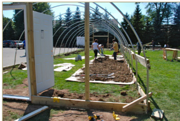
Greenhouse Raising Event, September 10th